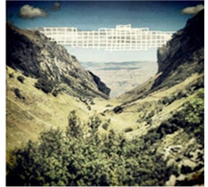
We tried to merge computational techniques with a visionary and provocative approach which considers architecture as a part of natural landscape.